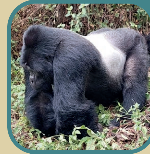
Virunga National Park