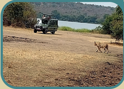
The Akagera National Park