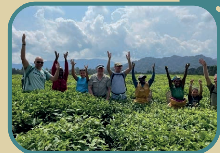
Tea discovery near the Nyungwe Forest